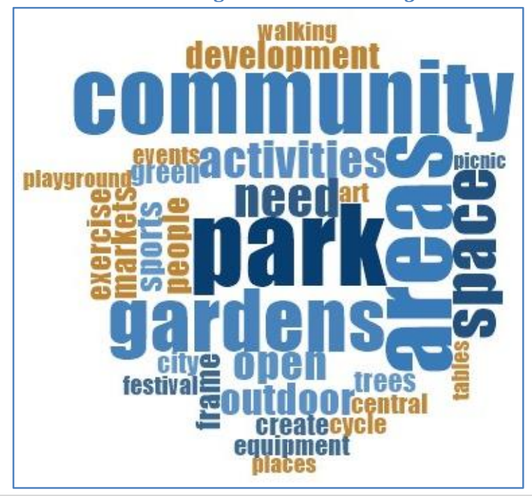
The 30 most common words used with regard to activities sought

A few commenters opposed the park development. The text that follows discusses all comments made on this question.