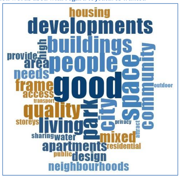
The 30 most common words used with regard to features wanted

A broad range of other comments were also provided. The text that follows discusses all comments made on this question.