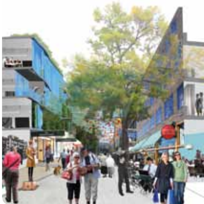
Illustrative concept of a compact core.