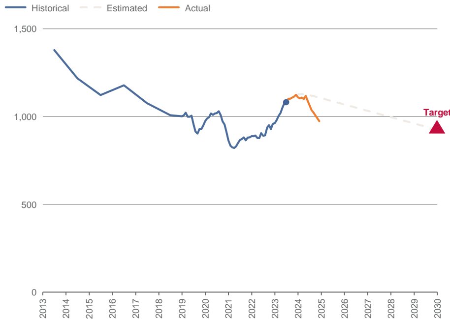
Total number of children and young people with serious and persistent offending behaviour